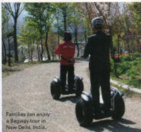
Families can enjoy a Segway tour in New Delhi, India.